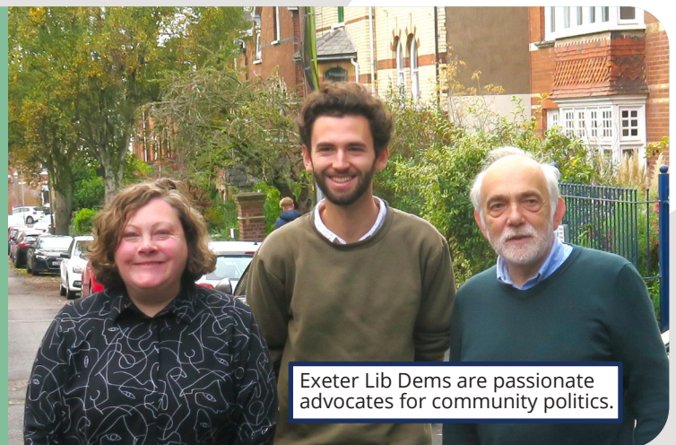
Exeter Lib Dems are passionate advocates for community politics.

Lib Dems want to ensure the benefits of a growing city are shared with every community. We would ensure money from developer levies gets redistributed to rejuvenate Exeter's neighbourhoods, particularly the most deprived areas.