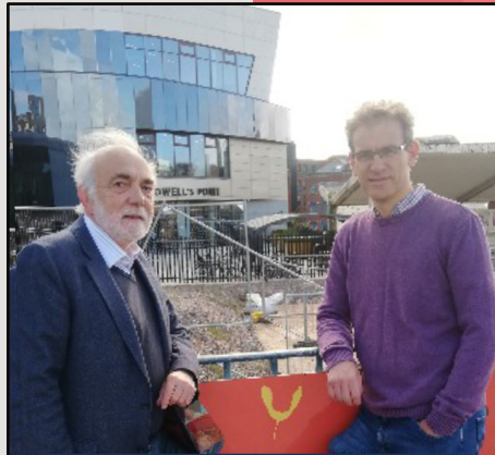
Labour's city centre vanity schemes have cost £50m+ and decimated council finances.

Focusing on getting the basics right would free up resources to deliver more effective safety, environmental and affordable housing schemes.