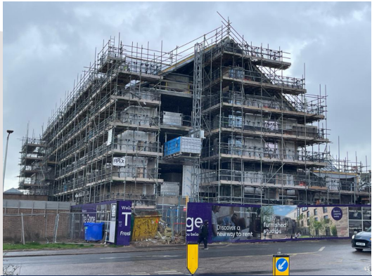
The Gorge - the only co-living block in Exeter to date. It still has many empty rooms.

Purpose built student accommodation no longer receives a discount but 'co-living' blocks do. These bedsits are yet more cramped and unaffordable student blocks in another name. We need a mix of homes to reflect our diverse communities.