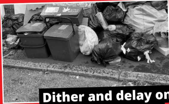
Dither and delay on kerbside food and glass recycling