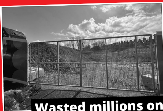
Wasted millions on housing scheme that failed to deliver