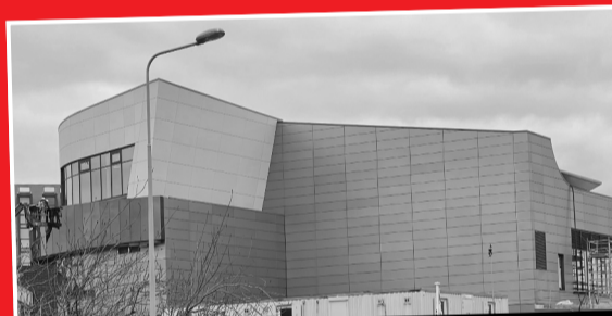
Wasted millions on their St Sidwell's Point leisure centre vanity project