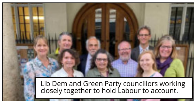
Lib Dem and Green Party councillors working closely together to hold Labour to account.

Following May's local elections, The Progressive Group on Exeter City Council - composed of Liberal Democrat and Green Party Cllrs - has grown to 9 councillors.