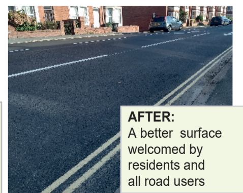
AFTER: A better surface welcomed by residents and all road users

We have also reported Isleworth Road's poor condition and other road defects.