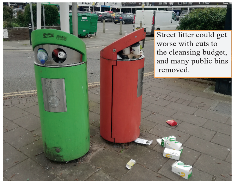
Street litter could get worse with cuts to the cleansing budget, and many public bins removed.

He said: "With examples like the Leisure Service now needing a £2 million per year subsidy, Labour have put Exeter in a financial hole. Tough decisions will have to be made to get our Council back to the core priorities people are asking for."