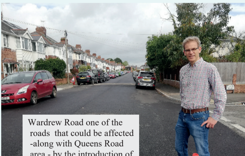
Wardrew Road one of the roads that could be affected -along with Queens Road area - by the introduction of a residents parking scheme

The long awaited residents parking plans have come through and the consultation has recently ended.