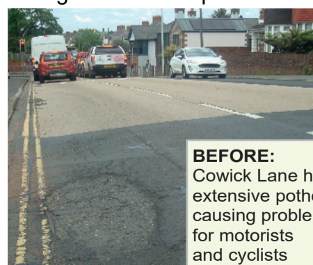
BEFORE: Cowick Lane had extensive potholes causing problems for motorists and cyclists

Devon County Council officers have been making an effort to engage with the local residents and seem to have done a good job. Thanks to all who have helped by moving cars and keeping calm through all the disruption.